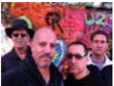
2U 1:00-2:00PM Patriot Plaza