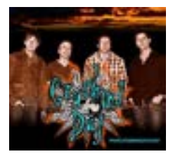
Crushing Day 6:00-7:30PM Courthouse Garden