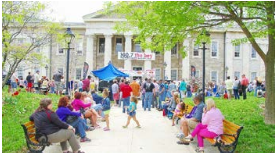
This year's festival is set for May 2nd and 3rd in the heart of Towson.

The Towsontown Spring Festival and Towson Gardens Day have been signature events to the Towson area for the past few decades. Both events provide great entertainment and economic support to the Towson community.