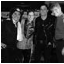
Synful Pleasure 12:20-1:45PM Patriot Plaza