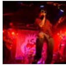
As If 4:00-5:30PM Patriot Plaza