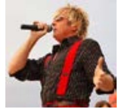
Sir Rod 6:00-7:30PM Patriot Plaza