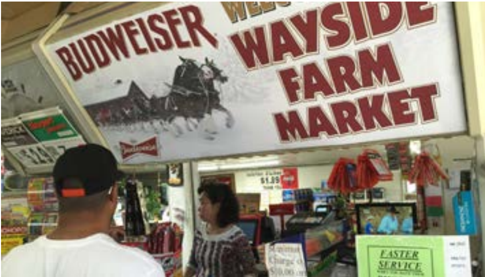
Customers checking out Wayside Market in Silver Spring, MD.

DC based energy savings company Nextility brings a fresh take on business energy procurement to Maryland.