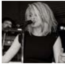
That's What She Said 2:10-3:30PM Patriot Plaza