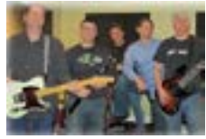
Project in Fidelity 2:00-3:00PM Courthouse Garden