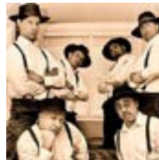
Amish Outlaws 4:00-5:30PM Patriot Plaza