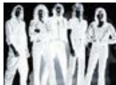
Almost Journey 2:30-3:30PM Patriot Plaza