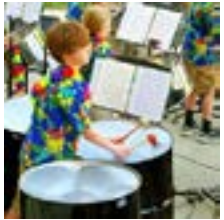
Loyola Blakefield 12:40-1:40PM Courthouse Garden