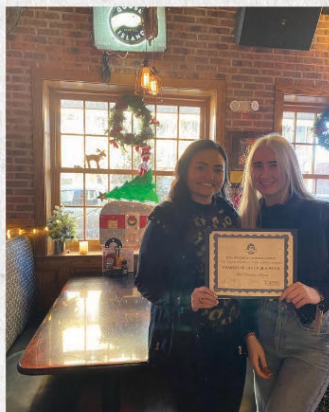
Charles Village Pub