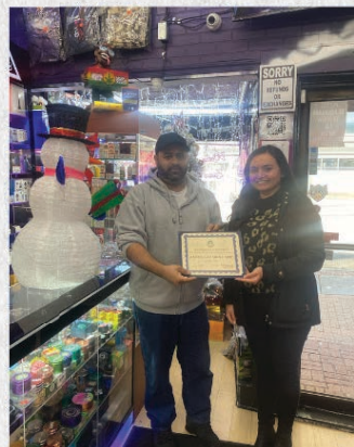
Zaza Cloud Smoke