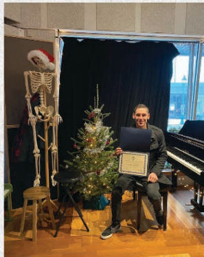
The Music Space