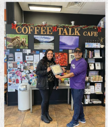
Coffee Talk Cafe